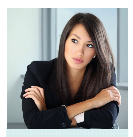
Visit our section on Motivating Employees for more ideas on how to maintain a positive and productive workforce.

More details and survey results are available in the report, 'Employee Benefits in the United States,' which is based on data from the National Compensation Survey.