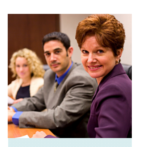
To learn more about employer-provided benefits, visit our section on Employee Benefits.