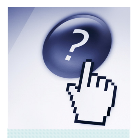
Our ADA-Disability section has more information regarding employer obligations under the Americans with Disabilities Act.

Marshall & Sterling Insurance will continue to provide you with updates and information regarding important issues. Should you have specific questions or need more information, please contact us.