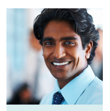
Tips on how to interview and guidelines on the interview process can be found here.

Additional tips and guidelines related to the interview process can be found in our section on How to Interview.